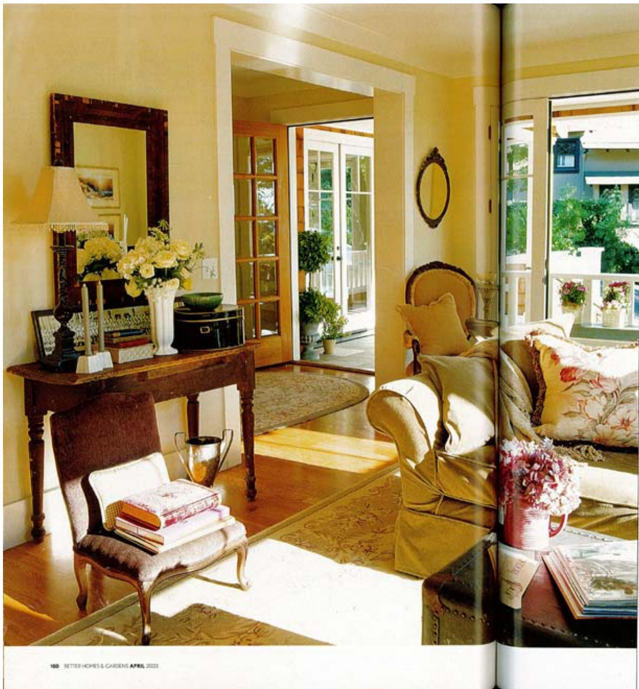
LOOKING INTO THE NEW ENTRANCE